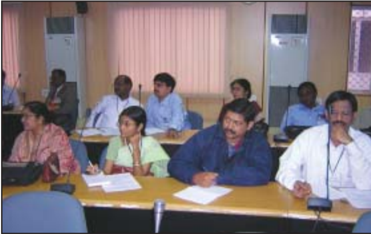
A section of the delegates keenly following the proceedings