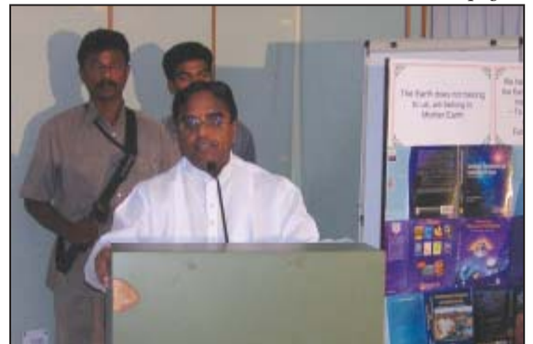
Minister for Major Irrigation Ponnala Lakshmaiah speaking at the valedictory