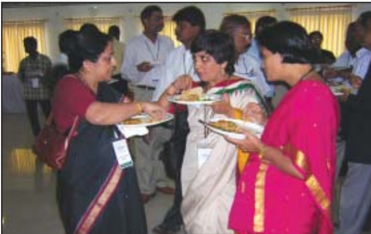
Delegates enjoying sumptuous meal at the conference venue