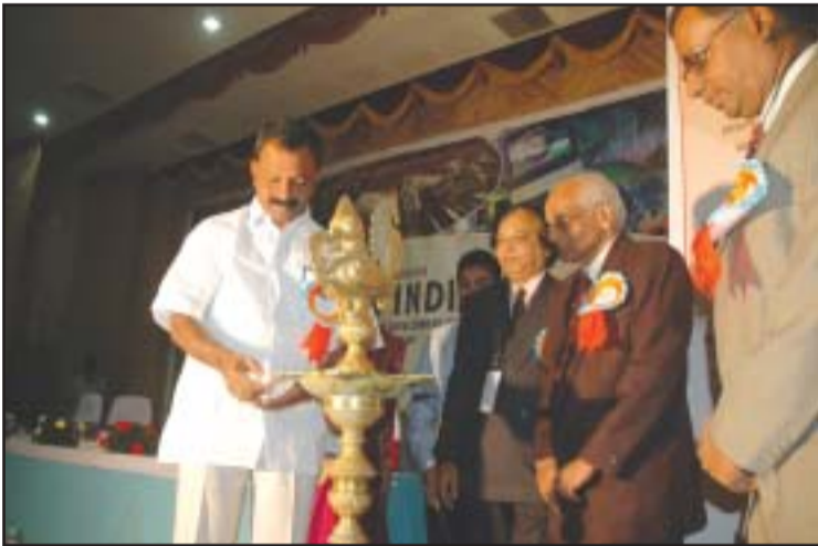
Minister for Agriculture N Raghuvendra Reddy lighting the lamp to mark the inauguration of the conference

Hyderabad, Nov 10-12: The third international conference on Rural India – Achieving millennium development goals and grassroots development, was a huge success in sensitising the governments, administrators, industry and the academia towards rural well-being and development, achieving millennium development goals and grass roots development and in obtaining an assurance from the government of Andhra Pradesh for setting up an earthcare policy institute.