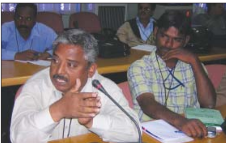
A delegate making a point