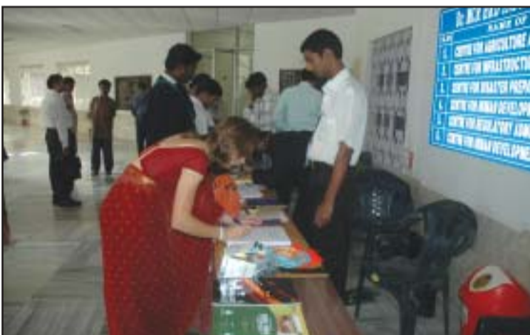
At the registration desk